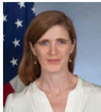
Ambassador Samantha Power , U.S. Ambassador to the UN