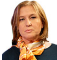
MK Tzipi Livni , Zionist Union