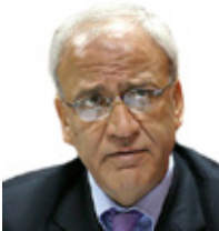
Dr. Saeb Erekat , PLO Secretary General