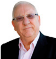
His Excellency Mr. Reuven (Ruvi) Rivlin , President of the State of Israel

His Excellency Mr. Reuven (Ruvi) Rivlin , President of the State of Israel MK Tzipi Livni , Zionist Union Dr. Saeb Erekat , PLO Secretary General